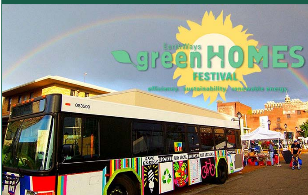
A spectacular rainbow welcomed Green Homes Festival attendees in 2009. Beneath it is the Metro Arts in Transit bus painted during the event.