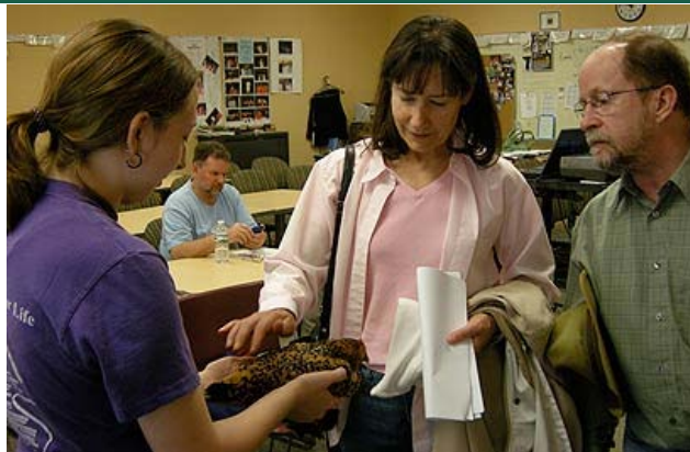
Workshop attendees learn about raising chickens during one of the workshops at the 2009 Green Homes Festival.