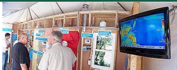
The Home Performance with Energy Star wall exhibit models common energy leaks and fixes staffed by local energy experts! See it at the Green Homes Festival.

"Green" can grow your biggest investment—your home—even in this economy! From basic leak-stopping weatherization to renewable energy conversions, you'll build your knowledge base and find skilled local businesses to work with you, at the Green Homes Festival . Learn to make best use of federal, state, and local tax incentives and product rebates, to save money as you invest in energy savings!