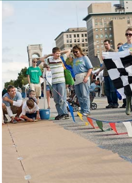
Participants prepare for solar car races at 2009 Green Homes Festival.