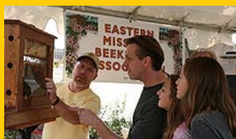
A family observes the activity of a thriving honey bee hive at the 2009 Green Homes Festival.

Theme: Urban Homesteading We will focus on this hot trend! Are you interested in keeping bees? Raising chickens? Growing tomatoes? Preserving your veggies? See how it's possible to settle on an ordinary city lot in a sustainable way.