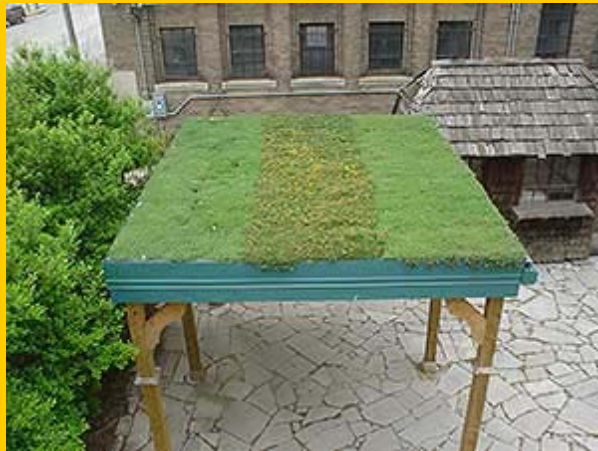
Drought-loving sedum tops the Green Roof Pavilion in EWC’s urban garden.