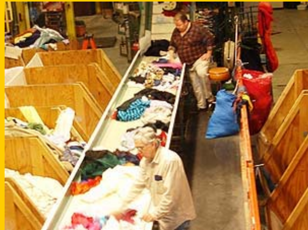
Employees sorting textiles for recycling at Remains, Inc.