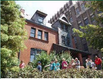
Visitors tour EarthWays Home.

Visit the EarthWays Home with your family and friends—explore many ways to live more sustainably in your own home! No reservations necessary—free for MBG members.