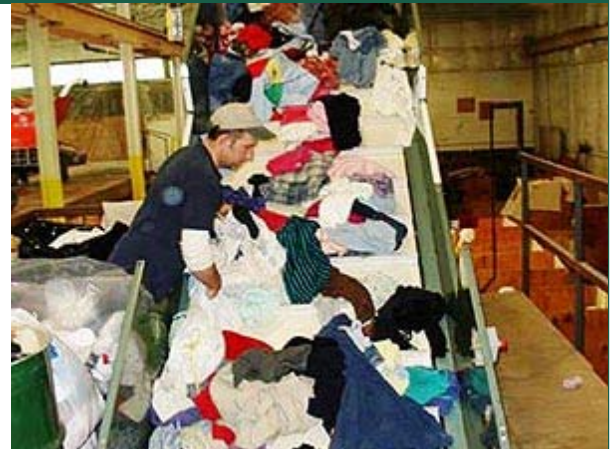
An employee sorts textiles for recycling at Remains, Inc. Remains is a sponsor of the upcoming clothing upcycling event, Swap-O-Rama-Rama, hosted by the Missouri History Museum on April 10th.