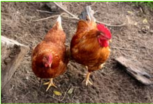
Raising chickens is an exciting journey in any setting while improving a family's diet and pocketbook!