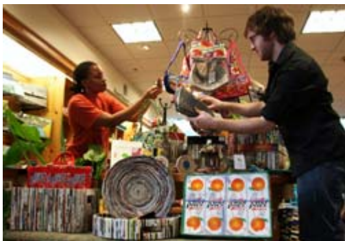
Offering Fair Trade and recycled-content products is only one of many ways the Missouri Botanical Garden's Garden Gate Shop is going Green.

demonstrates how to use their new bins.