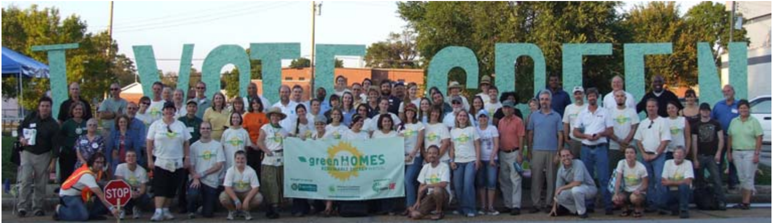
Exhibitors, presenters, volunteers and staff of the 2008 Green Homes & Renewable Energy Festival pause together at the end of a successful day.

The weekend of September 27-28 marked the return of our Green Homes & Renewable Energy Festival and Green House Tour in partnership with the Missouri Coalition for the Environment and sponsored by AmerenUE. Thanks to a lot of hard work the Festival and House Tour went off without a hitch!